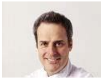
Phil Vickery Celebrity Chef